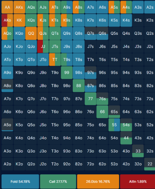
CO vs BTN 3bet